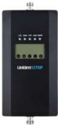
Uniden U70P In-Building Booster

Cellular boosters are our third product category with approximately 30 million of these devices sold globally every year. Siyata manufactures and sells Uniden® Cellular boosters and accessories for enterprise, first responder and consumer customers with a focus on the North America markets. Cellular communication provides a robust, secure environment not just for remote workers, in-home and in-vehicles; but also for restaurant patrons who wish to download menus; for patients at pharmacies who need to verify identity and download scripts; for remote workers who require strong clear cellular signals; and for first responders where connectivity literally means the difference between life and death - just to name a few examples. The vehicle vertical in this portfolio complements Siyata’s in-vehicle and rugged handheld smartphones as these sales can be bundled through the Company’s existing sales channels.