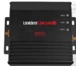
Uniden UM2M In-Vehicle Booster