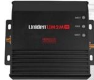
Uniden UM2M In-Vehicle Booster