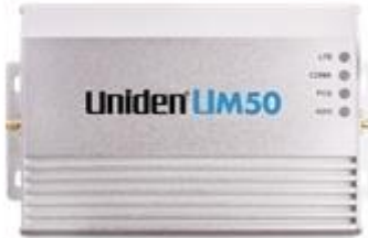
Uniden UM50 In-Vehicle Booster