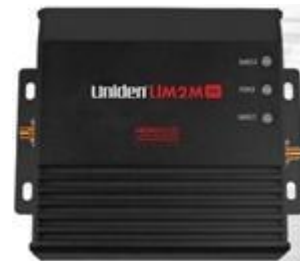
Uniden UM2M In-Vehicle Booster