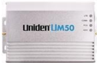
Uniden UM50 In-Vehicle Booster