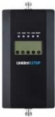
Uniden U70P In-Building Booster

Cellular boosters are our third product category with approximately 30 million of these devices sold globally every year. Siyata manufactures and sells Uniden® Cellular boosters and accessories for enterprise, first responder and consumer customers with a focus on the North America markets. Cellular communication provides a robust, secure environment not just for remote workers, in-home and in-vehicles; but also for restaurant patrons who wish to download menus; for patients at pharmacies who need to verify identity and download scripts; for remote workers who require strong clear cellular signals; and for first responders where connectivity literally means the difference between life and death - just to name a few examples. The vehicle vertical in this portfolio complements Siyata’s in-vehicle and rugged handheld smartphones as these sales can be bundled through the Company’s existing sales channels.