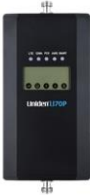
Uniden U70P In-Building Booster