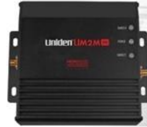
Uniden UM2M In-Vehicle Booster