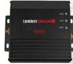
Uniden UM2M In-Vehicle Booster