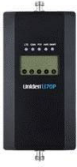
Uniden U70P In-Building Booster

Cellular boosters are also offered by Siyata with approximately 30 million of these devices sold globally every year. Siyata manufactures and sells Uniden® Cellular boosters and accessories for enterprise, first responder and consumer customers with a focus on the North America markets. Cellular communication provides a robust, secure environment not just for remote workers, in-home and in-vehicles; but also for restaurant patrons who wish to download menus; for patients at pharmacies who need to verify identity and download scripts; for remote workers who require strong clear cellular signals; and for first responders where connectivity literally means the difference between life and death - just to name a few examples. The vehicle vertical in this portfolio complements Siyata's rugged handsets and in-vehicle devices as these sales can be bundled through the Company's existing sales channels.