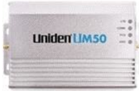
Uniden UM50 In-Vehicle Booster