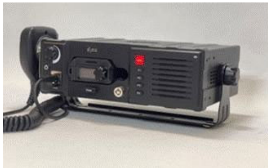
VK7 Vehicle Kit

Siyata also offers purpose built in-vehicle communication devices. In 2022, Siyata launched the VK7, a first-of-its-kind, patent-pending vehicle kit with an integrated 10-watt speaker, a simple slide-in connection sleeve for the SD7 Handset, and an external antenna connection for connecting an antenna to allow for an in-vehicle experience for the user that is similar to that from a traditional land mobile radio (“LMR”) device. The VK7 has been uniquely designed to be used with the SD7 Handset, while connecting directly into the vehicle’s power and can also connect to our cellular amplifier for better cellular connectivity. The pending patent for the VK7 Vehicle Kit provides temperature control by heating the VK7 in cold environments, and cooling the VK7 in hot environments. The VK7 can also be equipped with an external remote speaker microphone (“RSM”) to ensure compliance with hands-free communication legislation.