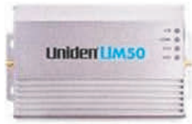
Uniden UM50 In-Vehicle Booster