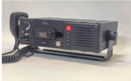
VK7 Vehicle Kit

Siyata also offers purpose built in-vehicle communication devices. In 2022, Siyata launched the VK7, a first-of-its-kind, patent-pending vehicle kit with an integrated 10-watt speaker, a simple slide-in connection sleeve for the SD7 Handset, and an external antenna connection for connecting an antenna to allow for an in-vehicle experience for the user that is similar to that from a traditional land mobile radio (“LMR”) device. The VK7 has been uniquely designed to be used with the SD7 Handset, while connecting directly into the vehicle’s power and can also connect to our cellular amplifier for better cellular connectivity. The pending patent for the VK7 Vehicle Kit provides temperature control by heating the VK7 in cold environments, and cooling the VK7 in hot environments. The VK7 can also be equipped with an external remote speaker microphone (“RSM”) to ensure compliance with hands-free communication legislation.