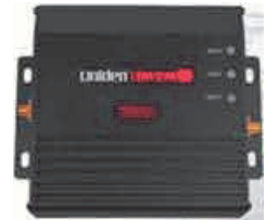
Uniden UM2M In-Vehicle Booster