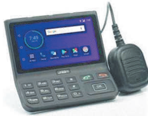
UV350 In-Vehicle Device

The aforementioned portfolio of solutions offers the benefits of PoC without any of the difficulties managing the current generation of rugged smart/feature phones and is ideally suited as a perfect upgrade from Land Mobile Radios (“LMR”). Used for generations, LMR has a significant number of limitations, including network incompatibility, limited coverage areas, and restricted functionality that leave a huge need for a unified network and platform. Siyata’s innovative PoC product lines are helping to service the generational shift from LMR to PoC. According to VDC Research, the LMR market is growing at a 5.9% compound annual growth rate, while the PoC market is growing at 13.6% CAGR to a projected $7 Billion by the year 2027.