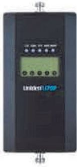
Uniden U70P In-Building Booster

Cellular boosters are also offered by Siyata with approximately 30 million of these devices sold globally every year. Siyata manufactures and sells Uniden® Cellular boosters and accessories for enterprise, first responder and consumer customers with a focus on the North America markets. Cellular communication provides a robust, secure environment not just for remote workers, in-home and in-vehicles; but also for restaurant patrons who wish to download menus; for patients at pharmacies who need to verify identity and download scripts; for remote workers who require strong clear cellular signals; and for first responders where connectivity literally means the difference between life and death - just to name a few examples. The vehicle vertical in this portfolio complements Siyata's rugged handsets and in-vehicle devices as these sales can be bundled through the Company's existing sales channels.