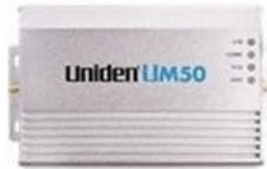
Uniden UM50 In-Vehicle Booster