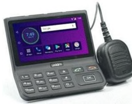
UV350 In-Vehicle Device

The aforementioned portfolio of solutions offers the benefits of PoC without any of the difficulties managing the current generation of rugged smart/feature phones and is ideally suited as a perfect upgrade from Land Mobile Radios (“LMR”). Used for generations, LMR has a significant number of limitations, including network incompatibility, limited coverage areas, and restricted functionality that leave a huge need for a unified network and platform. Siyata’s innovative PoC product lines are helping to service the generational shift from LMR to PoC. According to VDC Research, the LMR market is growing at a 5.9% compound annual growth rate, while the PoC market is growing at 13.6% CAGR to a projected $7 Billion by the year 2027.