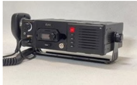
VK7 Vehicle Kit

Siyata also offers purpose built in-vehicle communication devices. In 2022, Siyata launched the VK7, a first-of-its-kind, patent-pending vehicle kit with an integrated 10-watt speaker, a simple slide-in connection sleeve for the SD7 Handset, and an external antenna connection for connecting an antenna to allow for an in-vehicle experience for the user that is similar to that from a traditional land mobile radio (“LMR”) device. The VK7 has been uniquely designed to be used with the SD7 Handset, while connecting directly into the vehicle’s power and can also connect to our cellular amplifier for better cellular connectivity. The pending patent for the VK7 Vehicle Kit provides temperature control by heating the VK7 in cold environments, and cooling the VK7 in hot environments. The VK7 can also be equipped with an external remote speaker microphone (“RSM”) to ensure compliance with hands-free communication legislation.