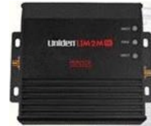
Uniden UM2M In-Vehicle Booster