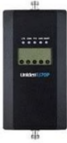
Uniden U70P In-Building Booster

Cellular boosters are also offered by Siyata with approximately 30 million of these devices sold globally every year. Siyata manufactures and sells Uniden® Cellular boosters and accessories for enterprise, first responder and consumer customers with a focus on the North America markets. Cellular communication provides a robust, secure environment not just for remote workers, in-home and in-vehicles; but also for restaurant patrons who wish to download menus; for patients at pharmacies who need to verify identity and download scripts; for remote workers who require strong clear cellular signals; and for first responders where connectivity literally means the difference between life and death - just to name a few examples. The vehicle vertical in this portfolio complements Siyata's rugged handsets and in-vehicle devices as these sales can be bundled through the Company's existing sales channels.